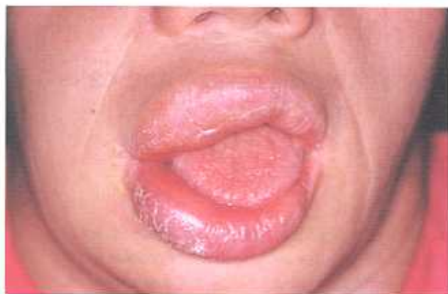
Fig 1 Labial swelling on the right side.